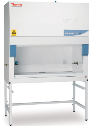
MSC.12 EN NF