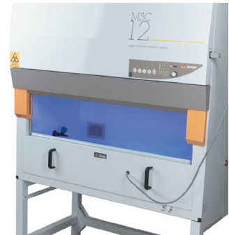
UV Front Enclosure