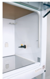
Easy access for cleaning Anemometer checks air flow

In order to achieve laminar flow, 70% of the air is internally recycled and 30% is exhausted with the replacement air taken in at the front aperture.