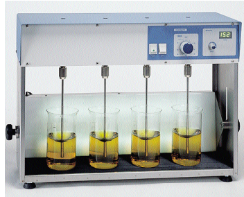
Flocculator with vertical illumination (4 places).

The main case of the unit is made of epoxy coated steel, with AISI 304 stainless steel supports with anti slip rubber feet.